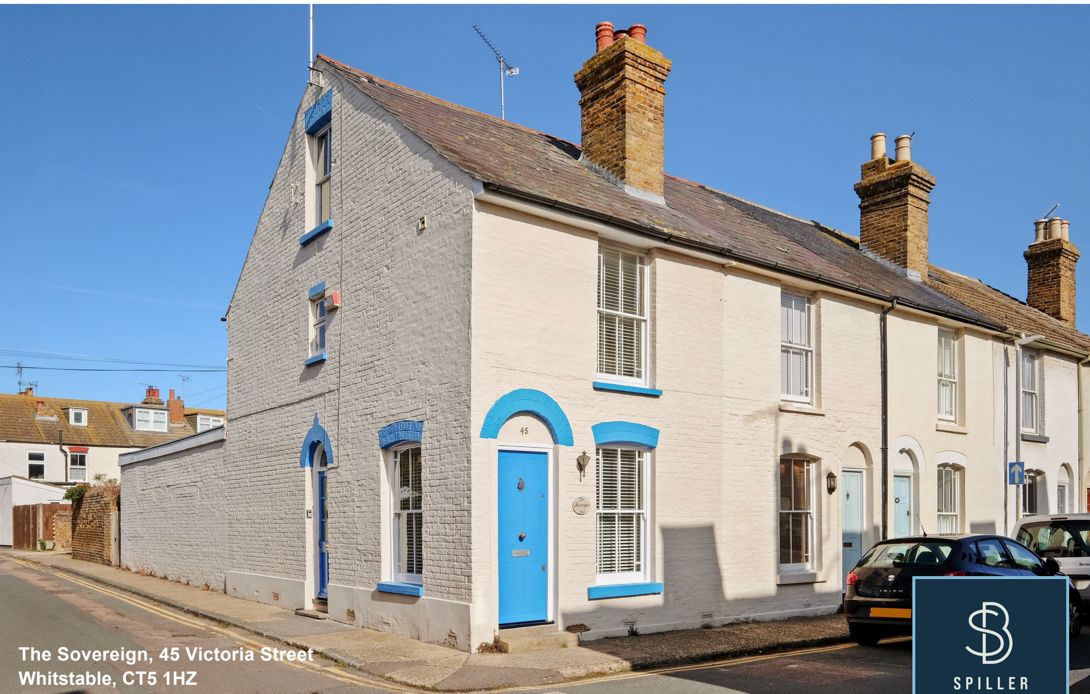
The Sovereign, 45 Victoria Street Whitstable, CT5 1HZ